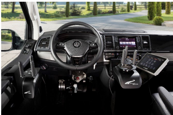
The second generation Space Drive Cockpit was already much more comfortable and also safer. With the introduction of PARAVAN Touch or voice control, up to 99 secondary functions of the vehicle can now be controlled.