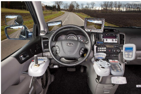
This is what the Space Drive cockpit of the first generation looked like. At that time, the secondary functions were still operated with many individual buttons.

An exciting day for the whole family will be offered at the open day on Sunday, 16 July from 10 am at the PARAVAN Mobility Park Aichelau. Celebrate 25 years of vehicle conversions, 20 years of drive-by-wire and 15 years of electric wheelchairs. An eventful day full of activities around the topic of mobility awaits the visitors and offers the opportunity to take a look behind the scenes of PARAVAN GmbH. A varied programme will be on offer, with something for everyone: From an early morning pint with the Albdorfmusikanten, guided tours of the PARAVAN mobility manufactory, wheelchair course, e-kart action with Space Drive, show performances by the rapper and PARAVAN customer "Drive-By", a colourful children's programme, classic car exhibition, drift show with Guinness Book record holder Alex Gräff, musical entertainment by the Hayingen town band in the afternoon, PARAVAN Tornado to touch, drive-by-wire demonstration drives and autograph session with our Space Drive pilots. Food and drink will also be provided with coffee, cakes, food trucks and a drinks stand.